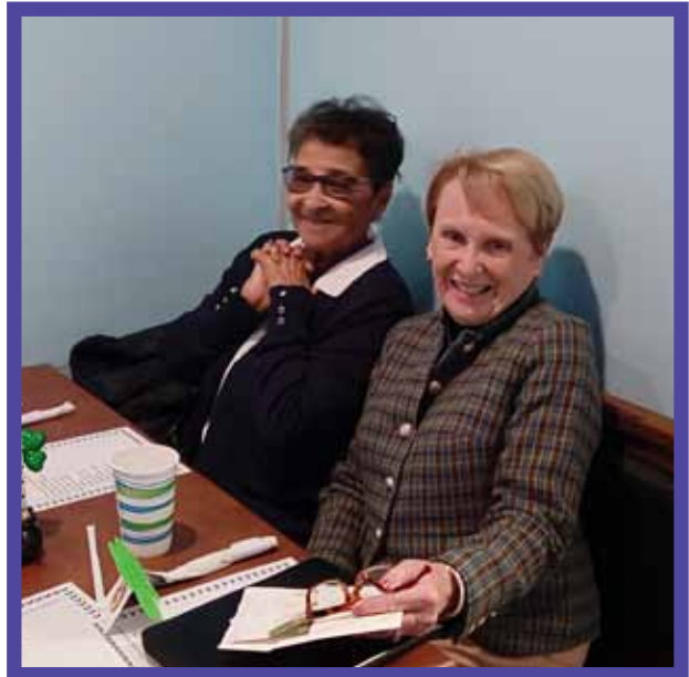
The March General Meeting of KCRSPA held at The Rock Rock Hall, Maryland It was a great brunch!